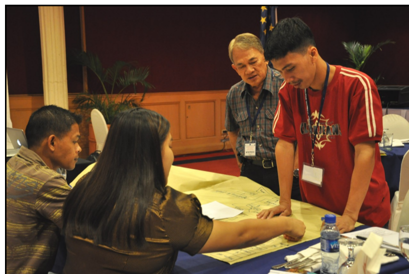
The awareness cum training built on the existing working knowledge of the participants who have been in the feedmill business operation for a long time. Feed millers who supply to EU registered farms will be subject to BFAR registration and inspection following EU accepted standards on food safety to ensure that food safety is implemented even in the supply chain.